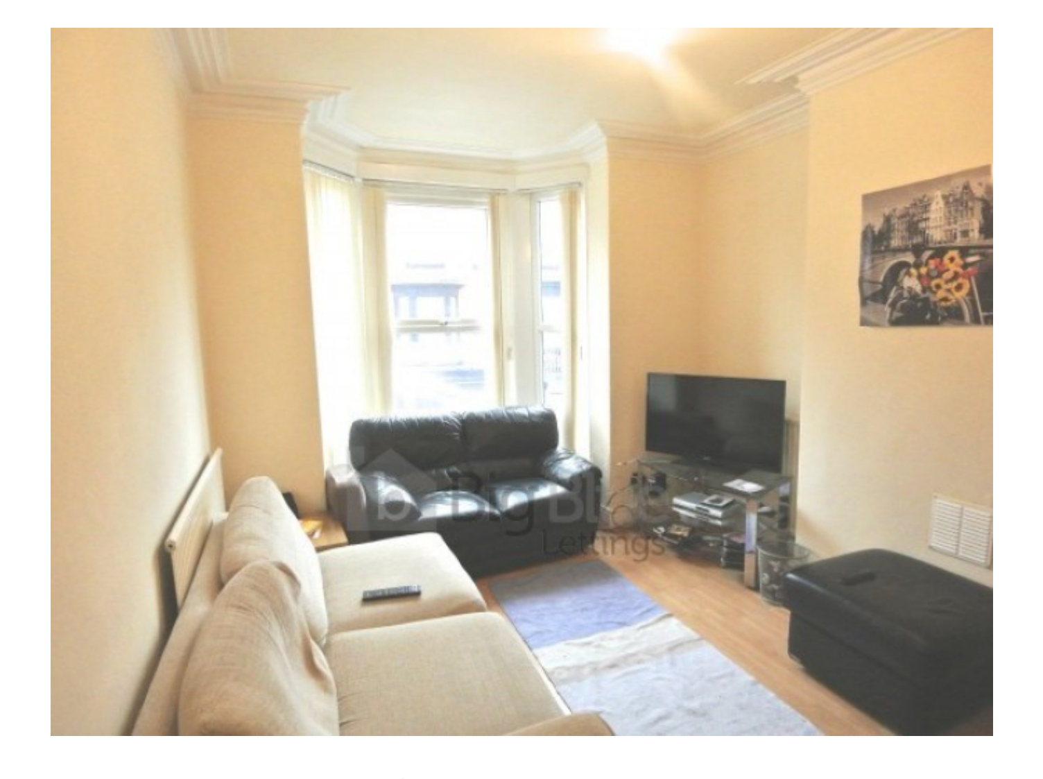
£140 Per Person Per Week

6 Ashville Terrace, Hyde Park, Four Bed, Leeds