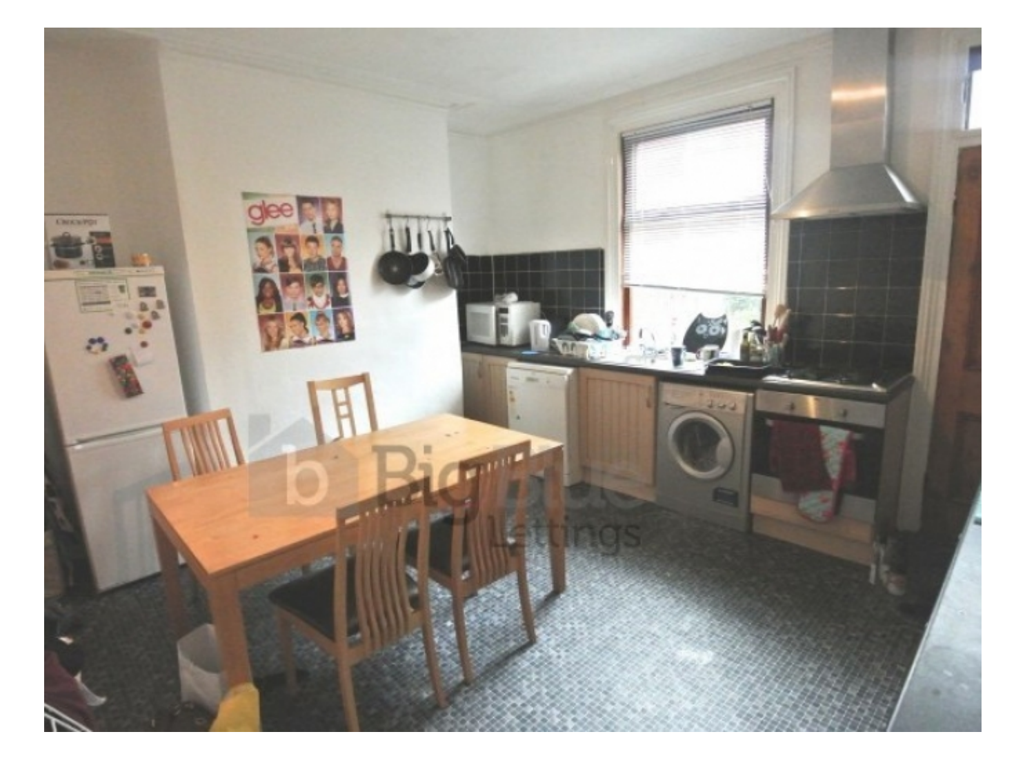
£136 Per Person Per Week

16 Ashville Terrace, Hyde Park, Four Bed, Leeds