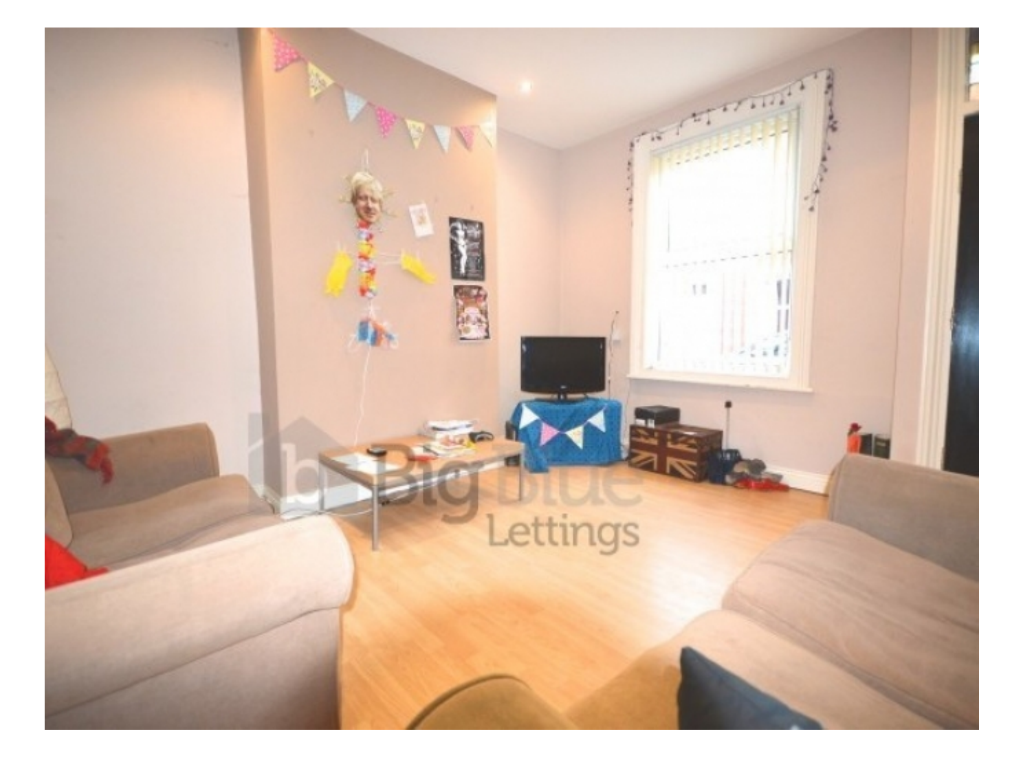
£110 Per Person Per Week

19 Welton Place, Hyde Park, Five Bed, Leeds