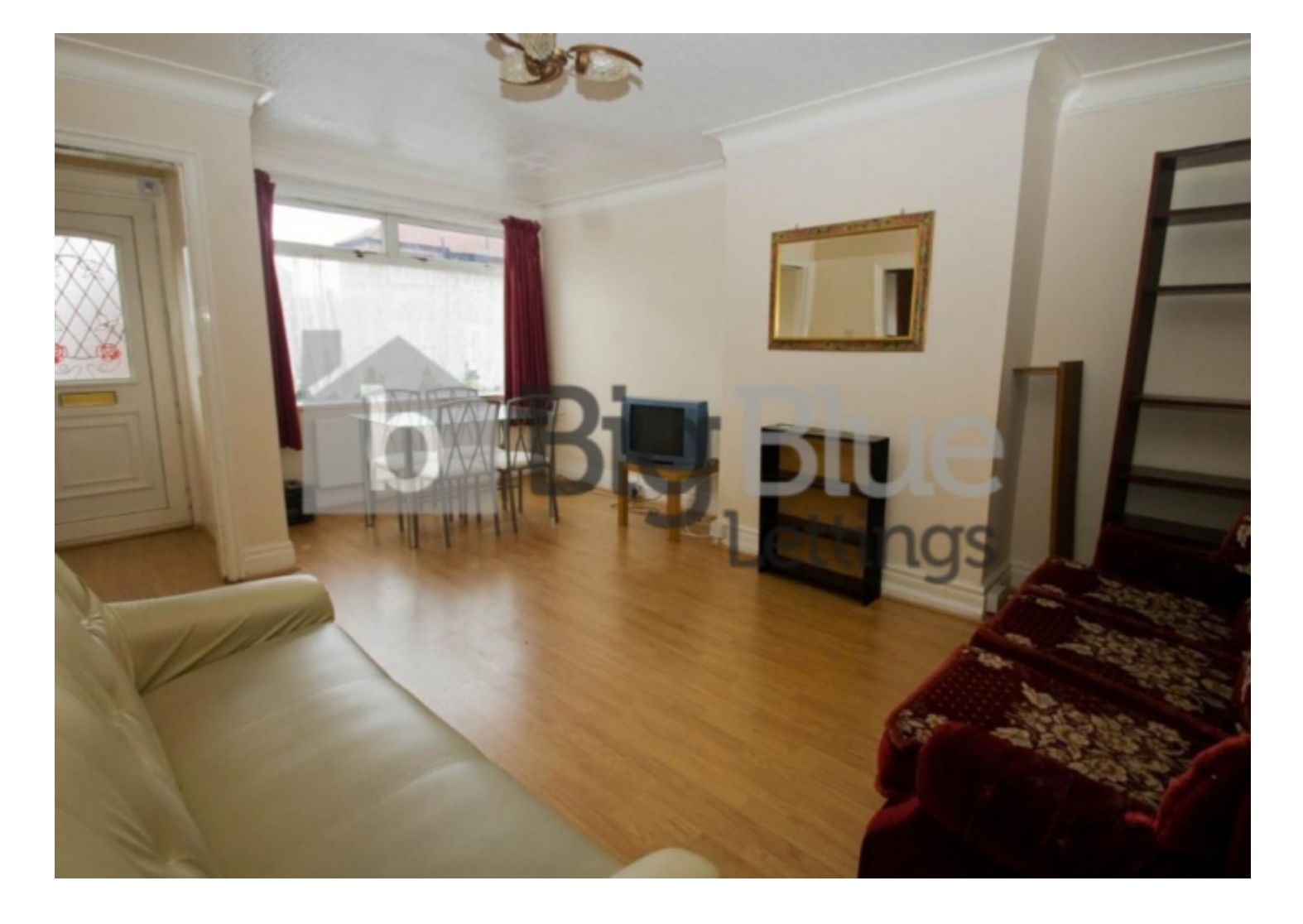
£115 Per Person Per Week

36 Hessle Avenue, Hyde Park, Three Bed, Leeds