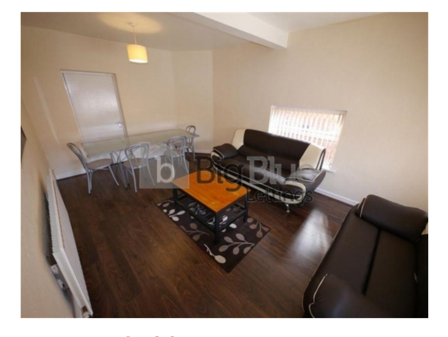
£132 Per Person Per Week

17 Mayville Road, Hyde Park, Five Bed, Leeds