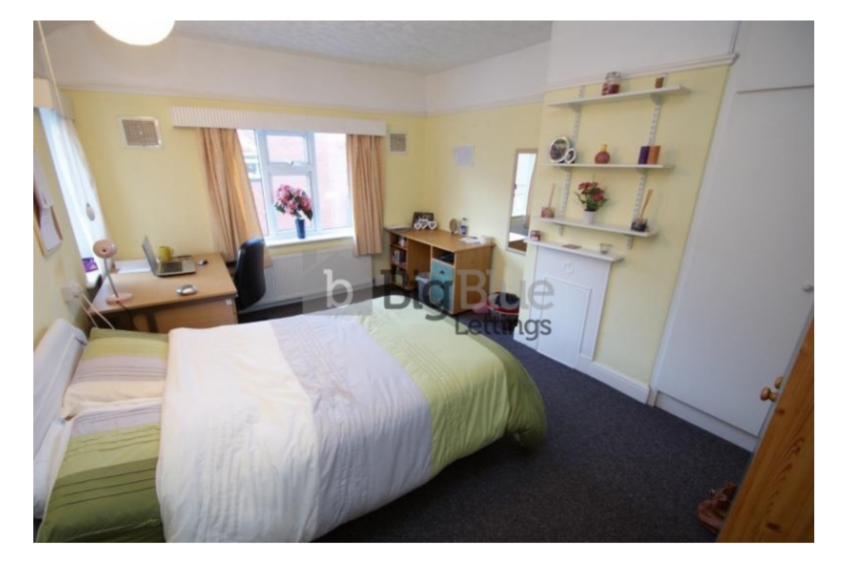
£85 Per Person Per Week

40 Mayville Terrace, Hyde Park, Three Bed, Leeds