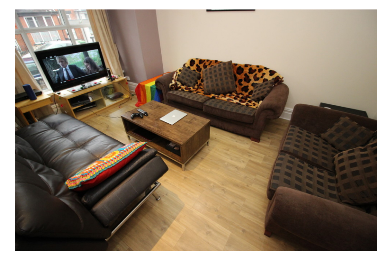
£136 Per Person Per Week

48 Chestnut Avenue, Hyde Park, Seven Bed, Leeds