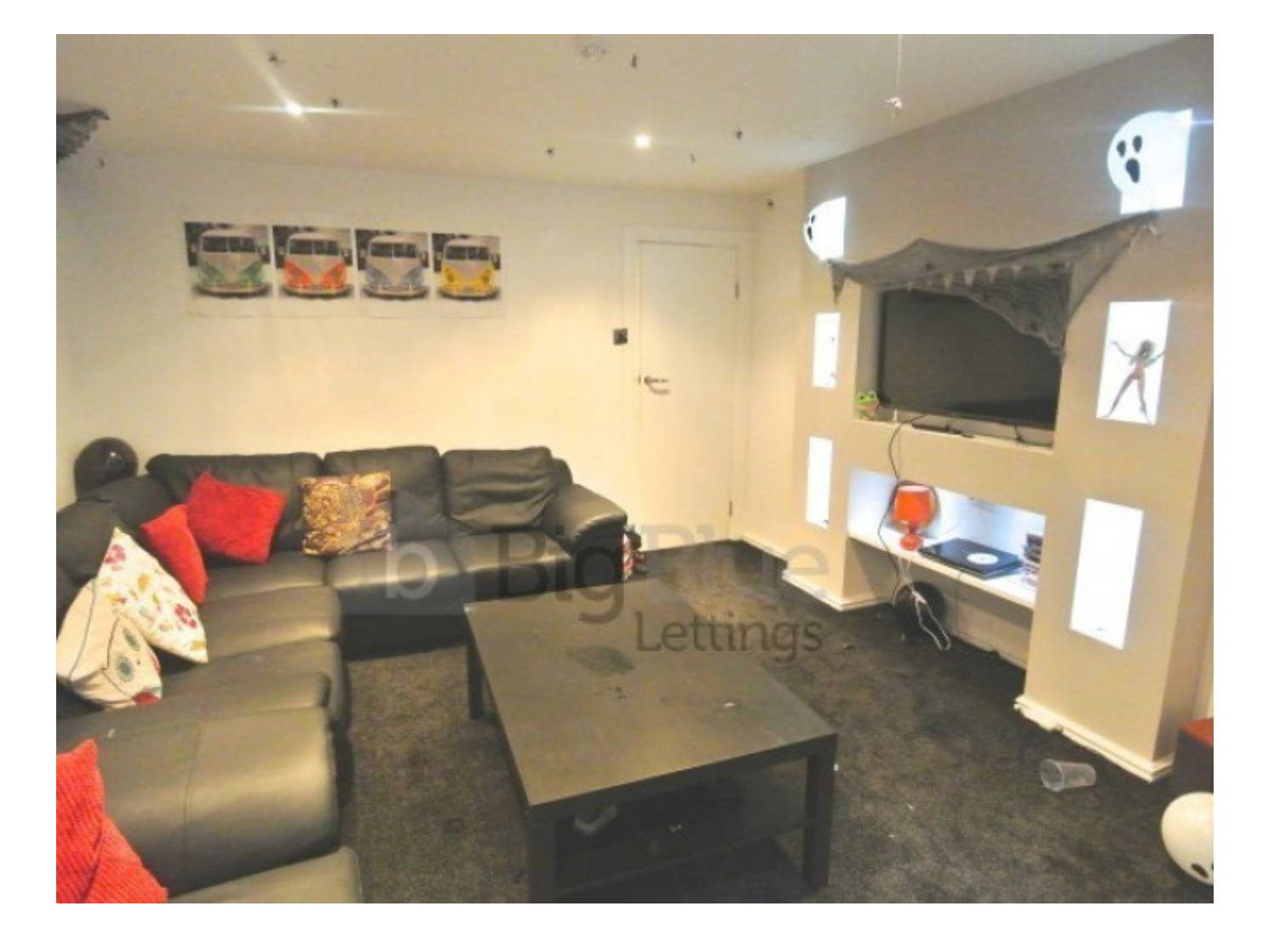
£140 Per Person Per Week

16 Chestnut Avenue, Hyde Park, Seven Bed, Leeds