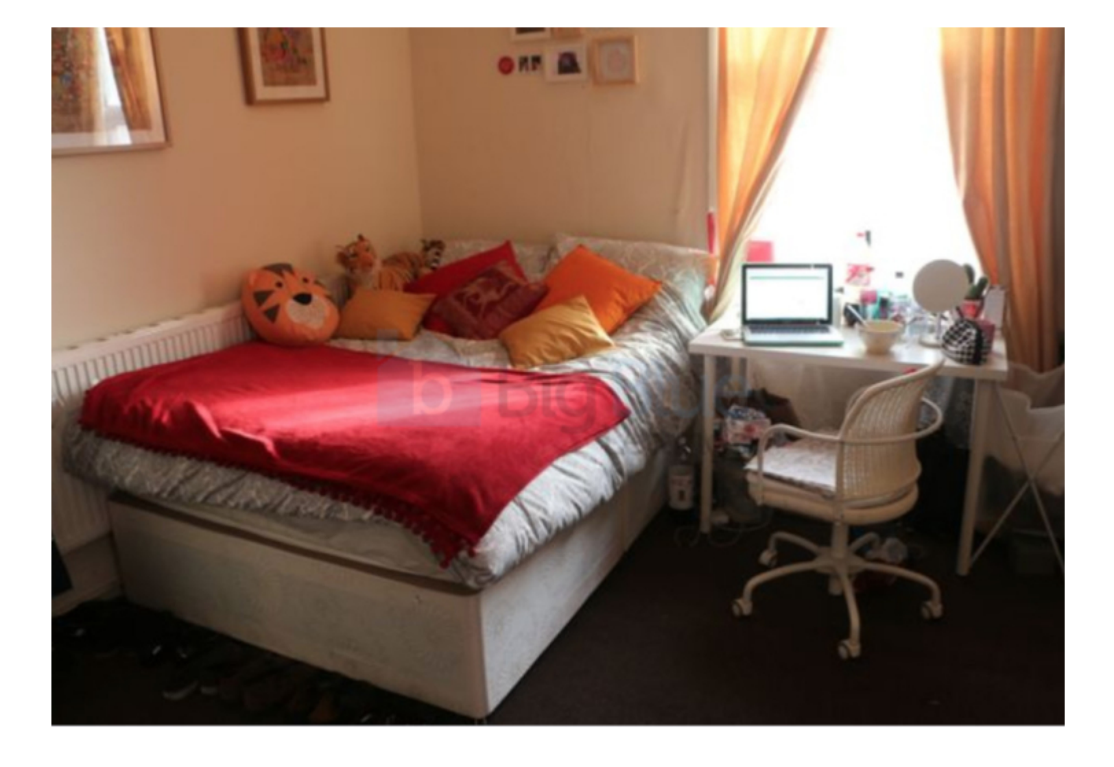
£114 Per Person Per Week

99 Brudenell Road, Hyde Park, Seven Bed, Leeds