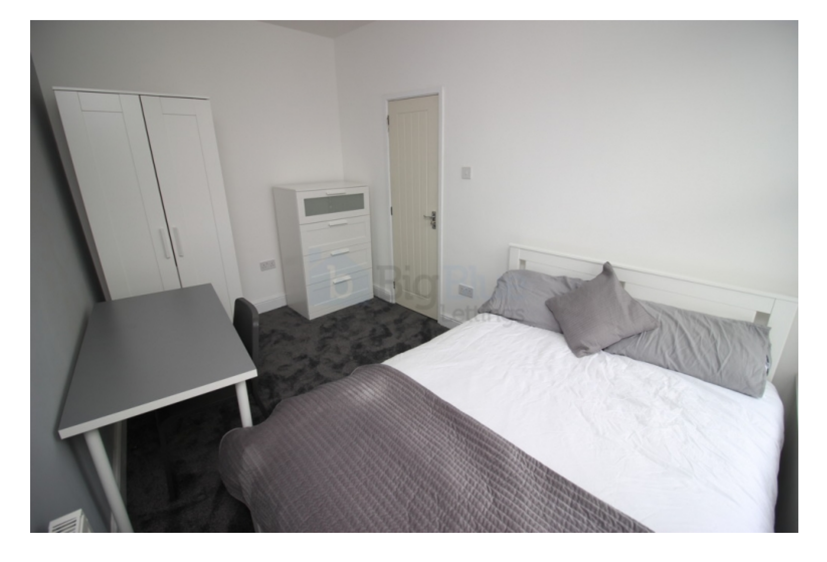
£120 Per Person Per Week

22 Kelsall Avenue, Hyde Park, Two Bed, Leeds